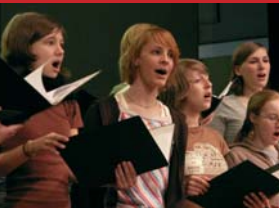
Neustadt an der Weinstraße