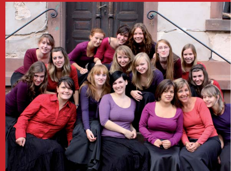
Pfälzische Kurrende – Winner of national and international awards